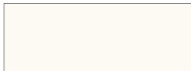
Coastal White LF17