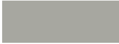
Light Gray LF04