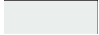
Bone White LF06