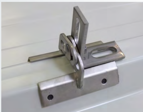
Position B Preparation for side rail mount