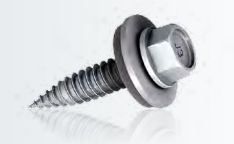
EJOFAST® thin-sheet metal screw JF3-2-5.5xL-E16 (#12)