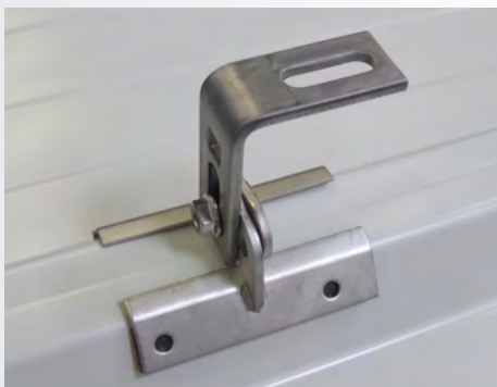
Position A Preparation for top rail mount

Adjustable Trap Bracket for PV and thermal solar installations.