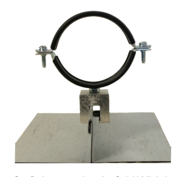
CanDuit pipe clamp

*Match outer diameter of the pipe/conduit to the adjustability range.